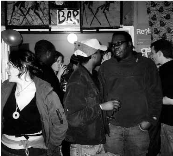
Insansa /Computers for Zambia evening of music, dancing and Zambian food held at the Centre.