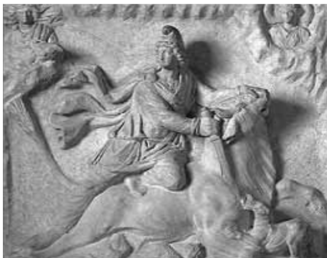
Sacrificing a bull before the sun and the moon.

On this night, the oldest member of the family says prayers, thanking God for previous year's blessings, and prays for prosperity in the coming year. Then he cuts the melon, and the watermelon and gives everyone a share. The cutting symbolizes the removal of sickness and pain from the family. Snacks are passed around throughout the night: pomegranates with angelica powder ( gol-par ) and Ajil-e shab-e yalda , a combination of nuts and dried fruits, particularly pumpkin and watermelon seeds and raisins. This mixture of nuts literally means night-grazing; eating nuts is said to lead to prosperity in days to come. More substantial fare for the night's feast include eggplant stew with plain saffron-flavored rice, rice with chicken, thick yogurt, and halva (saffron and carrot brownies). The foods themselves symbolize the balance of the seasons: watermelons and yogurt are eaten as a remedy for the heat of the summer, since these fruits are considered cold, or sardi ; and halva is eaten to overcome the cold temperatures of winter, since