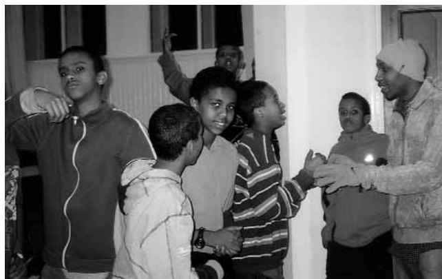
One of the last days of the old Youth Club – see overview of the year (page 1).

We hoped that this would lay the foundations for a more balanced response to local young peoples' needs. The imbalance in the previous