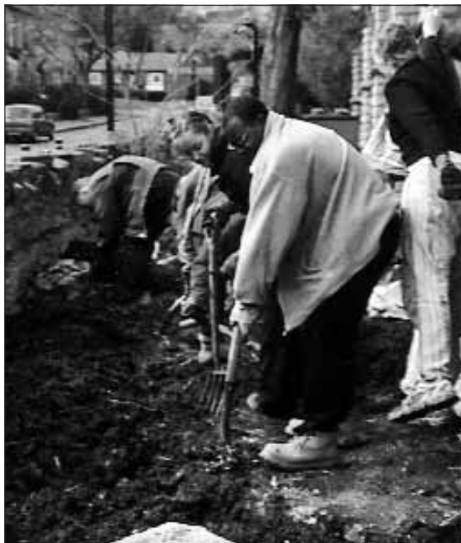
The HERB group of local people improving the Broomhall Centre's outside area, making a garden.

in this report but in reality I do most of the work of the centre, including fund-raising, by myself. I could do with some help.