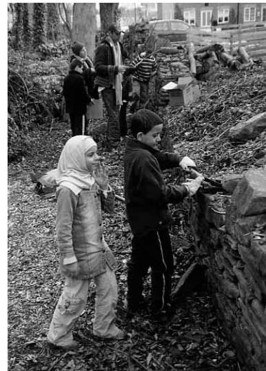
Making 'sculptures' at Lynwood.